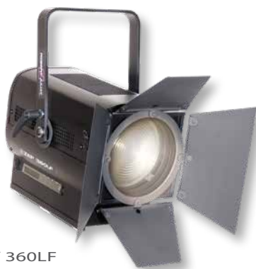
340LF / 360LF